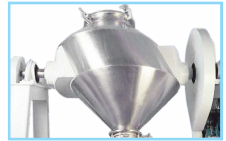
Asymmetric Double Cone Design