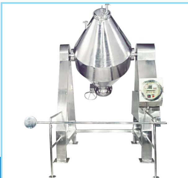
Double Pillar Mounted