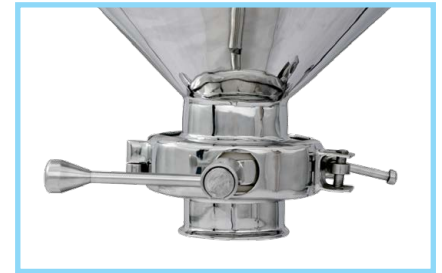
Sanitary Butterfly Valve