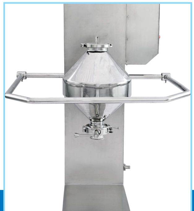
Single Pillar Mounted