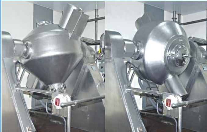
Ideal drying solution for Toxic Materials.