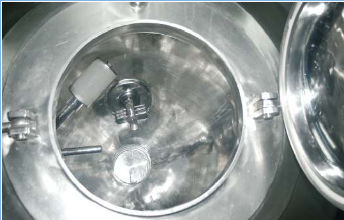
Knife edge chopper blades and the vacuum filter.