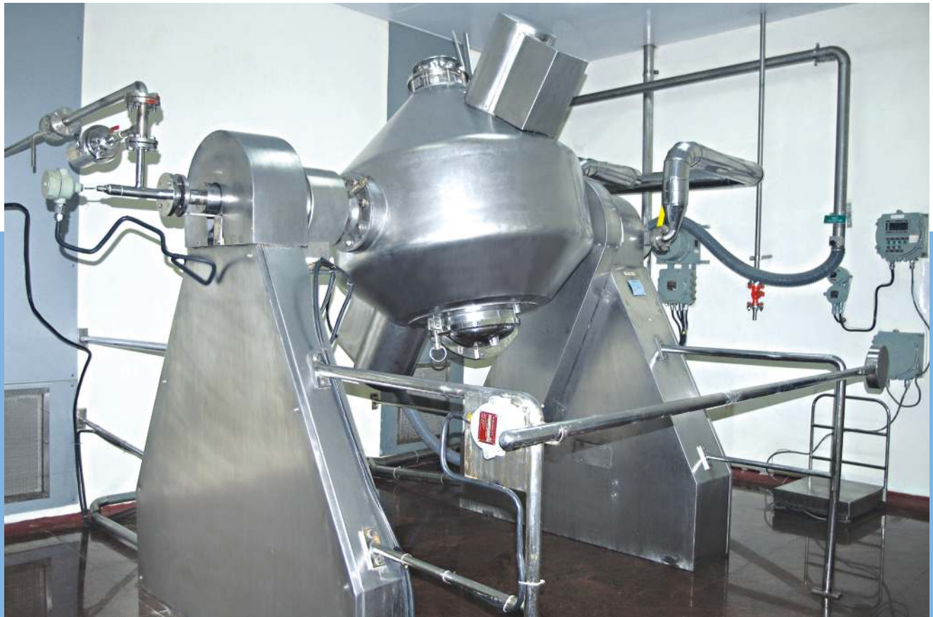
400 Ltrs. RCVD with 2 nos. choppers.

The Roto Cone Dryer with improved technology integrates drying operation under vacuum. The Roto Cone Dryer facilitates enhanced drying efficiency, low temperature operation and economy of process by total solvent recovery. It helps cGMP - based working by achieving optimum dust control, while offering the advantage of efficient charging and discharging of materials. The dryer is also available with an optional thermal medium system.