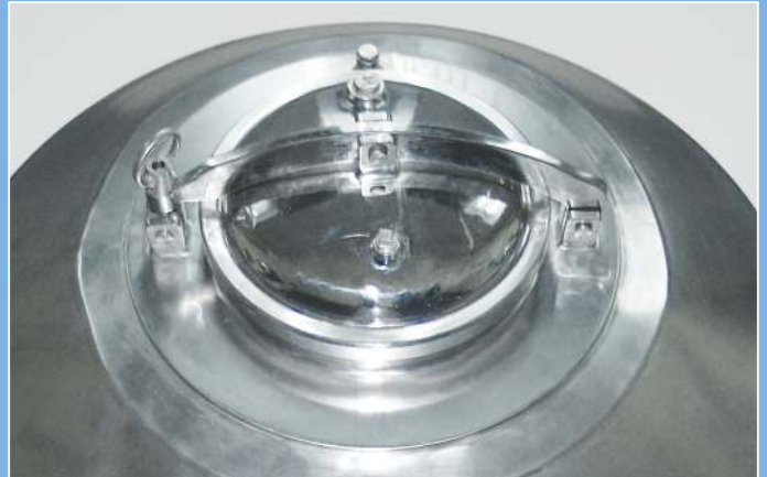
Easy operational manhole on a single knob.

Specification and technical data are subject to without prior notice